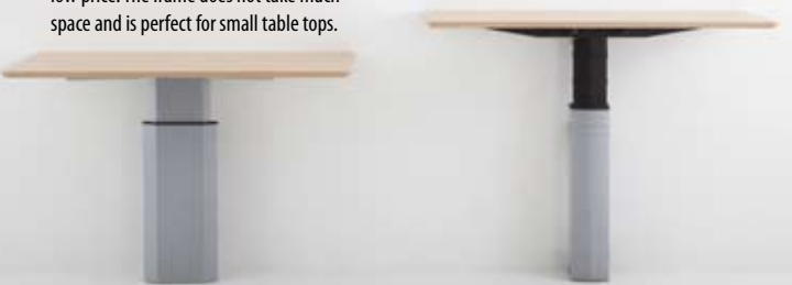
501-19 Wall gives maximum legroom and is still stylish and modern. A both functional and attractive work station.