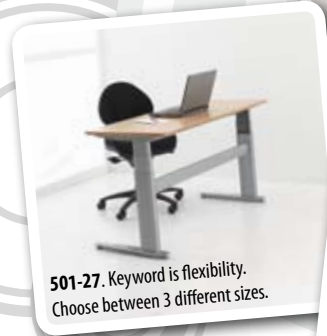
501-19 Basic has a functional single column frame. Perfect for wheels and battery.