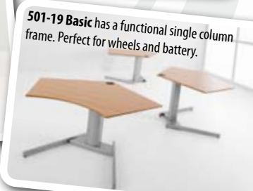
501-27. Keyword is flexibility. Choose between 3 different sizes.