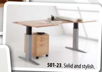
501-23. Solid and stylish.