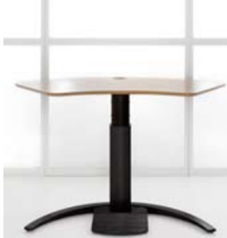
501-19 Design with the unique design. Stand-alone or setup i groups, both works excellent.