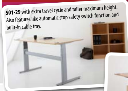
501-29 with extra travel cycle and taller maximum height. Also features like automatic stop safety switch function and built-in cable tray.